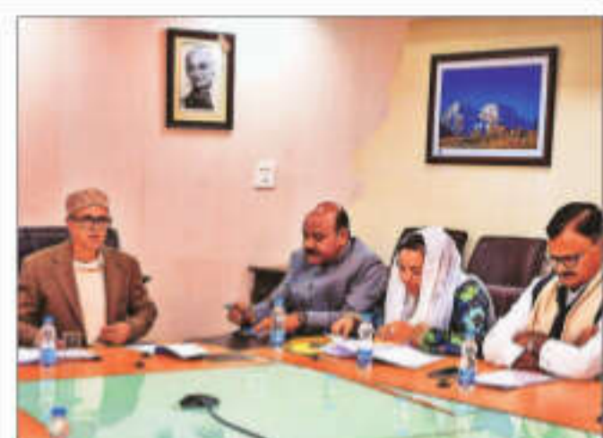
■ Opposition criticises Abdullah govt for bringing resolution on statehood instead of revocation of Article 370 and routing it through Cabinet

■ Cabinet to summon Assembly on November 4, has advised the L-G to address it