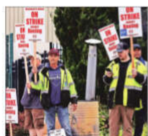
Boeing's unionised West Coast workers have been on strike since September 13

The latest offer includes a $7,000 ratification bonus, rein-